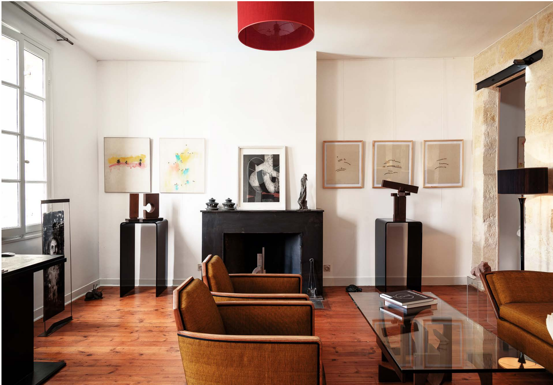
The soft golden stone in the library provides a fine contrast to the black-braided cloth of the two restored vintage chairs and seat. The low table in corten and glass is signed by Marino Di Teana. On the walls, Claire Forgeot's poetic landscapes are having a conversation with the geometric rigour of Marino Di Teana's sculptures. Away from direct light, the bookcase itself finds a safe place behind the stone wall.