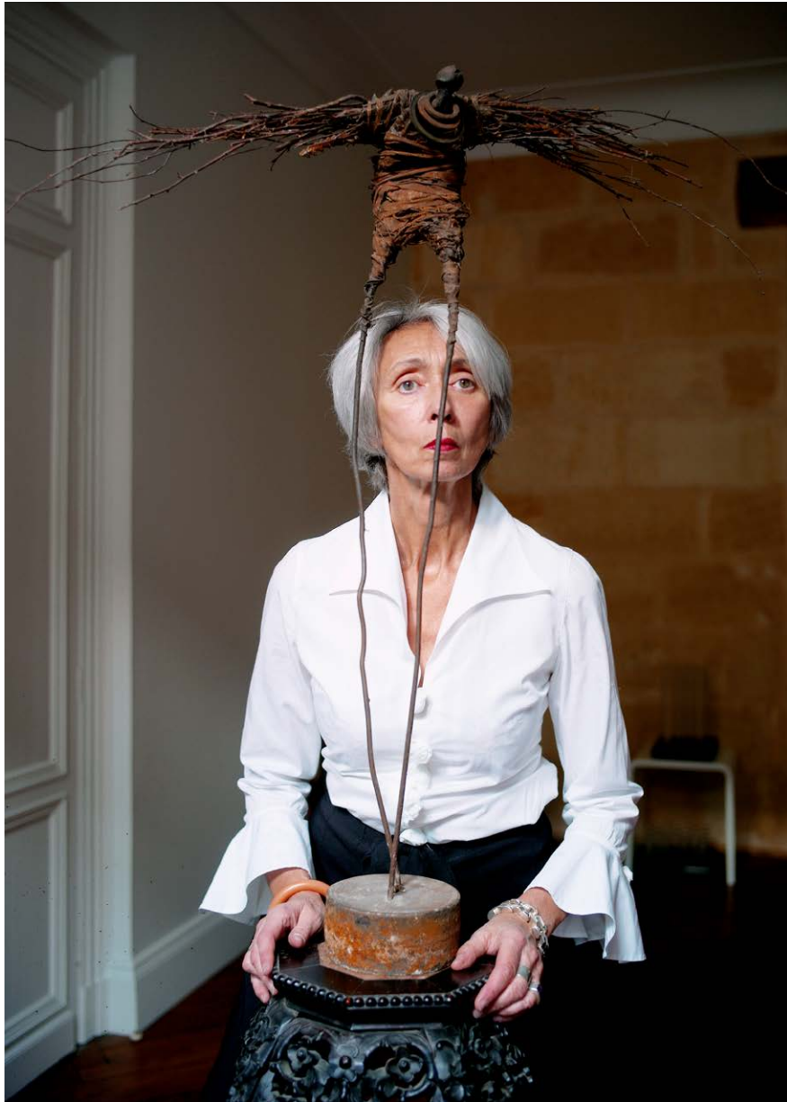
Above. Metal, textile, earth and vegetable sculpture by Marc Perez on a chiné ironwood base.